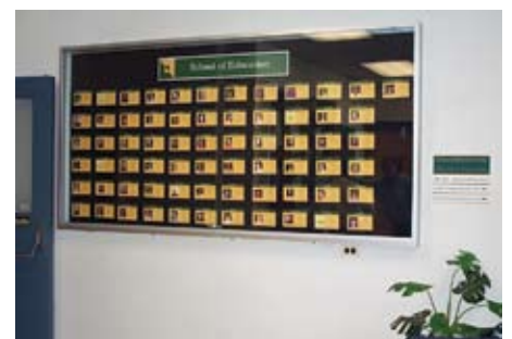
Signage around the building is being upgraded to improve the appearance and environment.