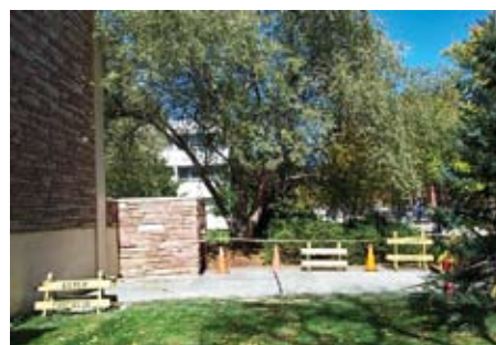
Cement was poured in mid-October to allow more bicycle racks to be added.

Be on the alert for changes, and if you would like to contribute to the improvements, check the School of Education Enrichment Fund on the donation form to direct your gift to this worthy cause.